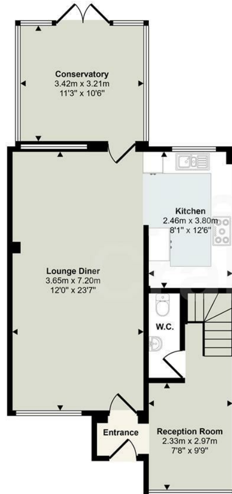
Ground Floor Approx 64 sq m / 684 sq ft

Approx Gross Internal Area 110 sq m / 1183 sq ft